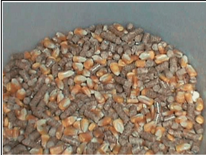
Wood Pellet & Corn Blend 50/50%

Please read this entire manual before operation. Save these instructions.