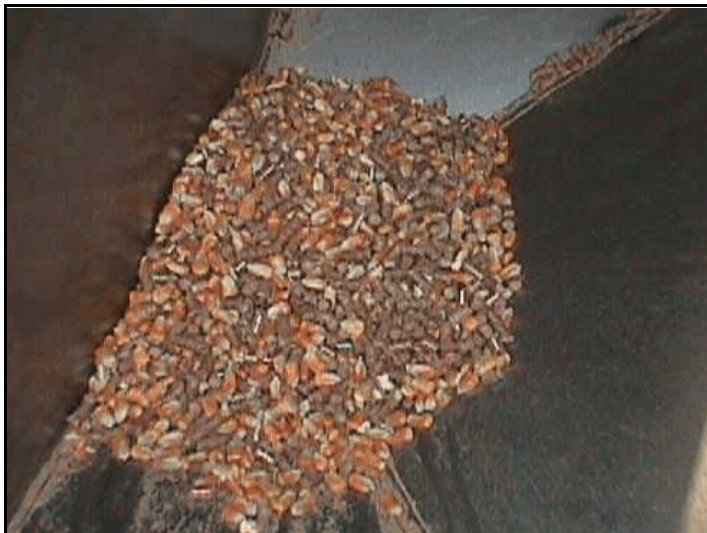
Figure 2 Pellets and corn separating in hopper.

The wall thermostat is designed to automatically regulate the room temperature from the control panel heat setting to the "Off" setting based upon room temperature. Remember to leave the control panel on the "Medium or High" position when utilizing the wall thermostat feature. When burning corn mixtures of 40% or more thermostat operation is not recommended. Corn tends to light slower and cause more build up in the burn pot.